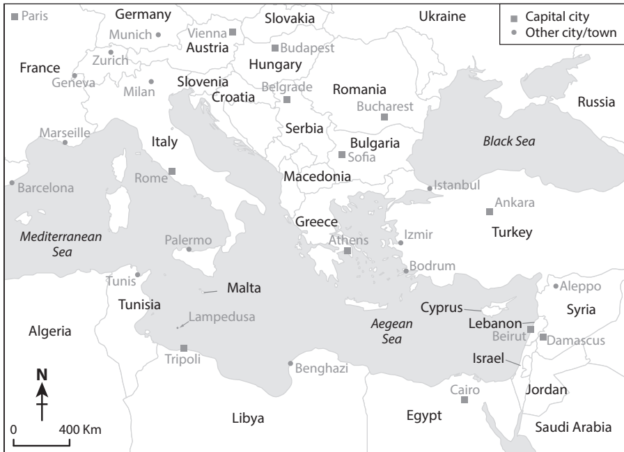
MAP INTRO.1. Central and Eastern Mediterranean