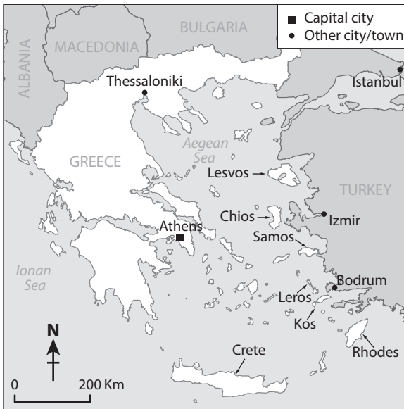
MAP INTRO.2. The Aegean Sea, featuring Greek islands

grant crisis began to recede in favor of appeals for compassion in the face of tragedy, accompanied by a reinvigorated (if ephemeral) language of “refugee crisis” (New Keywords Collective 2016).