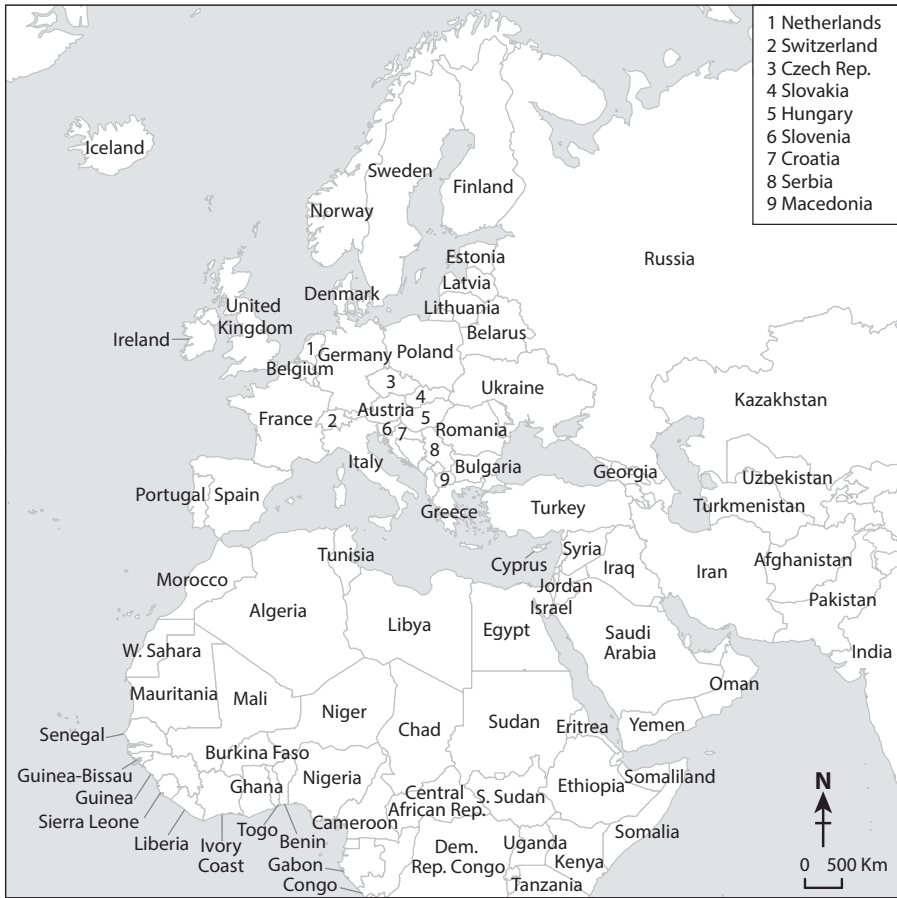
MAP INTRO.4. Europe Provincialized

War have ensured that some regions of “the East” of Europe have been and largely remain a crucial reserve of migrant labor, both within and across the borders of EU citizenship and mobility (Dzenovska 2013a, 2014). This is particularly pertinent with regard to the Balkans, as Europe extends eastward toward Turkey as the perhaps most enduring Orientalized frontier (Mastnak 2003). It is, of course, not incidental that it is precisely the southeastern European countries that previously found themselves within the realm of the Ottoman Empire, where many Europeans themselves are Muslim, that the borders of Europe become riddled with ambiguity, whereby cultural essentialisms can be readily converted into effectively racialized ones. In this manner, European-ness